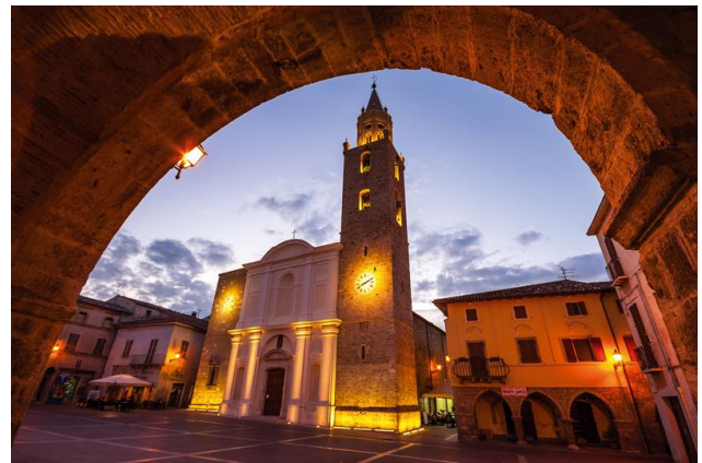
(In the photos Santa Maria in Platea)

After the Roman era, the new statutes of Campli witness about a huge district protected by walls and accessible through doors and bridges - the East Door (also known as Angevin, or St. John Door) is unfortunately the only one survived. Campli is also a relevant site for religious tourism as it hosts the unique Holy Stairs, a unique fabric leaning on the side of the Church of St. Paul and the Church of Santa Maria in Platea where one of the 23 Holy Doors of Abruzzo has been open for the Extraordinary Jubilee of Mercy that will last until the 20 th of November 2016.