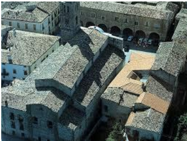
(In the photos city center and Necropolis)

Campli is an Italian town counting around 7.279 citizens in the Province of Teramo - Abruzzo Region, and it is part of the local territorial authority "Comunità Montana della Laga". The town is well known for its religious, civil and historical architectures like the Necropolis of Campo Valano dating back to the VI and V centuries B.C. or the National Archaeological Museum, located in the Franciscan Convent.